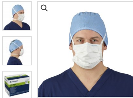
Image shown for reference purposes only. Actual product appearance may vary.